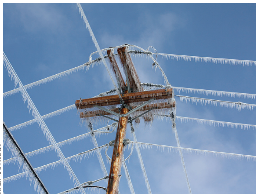
JACKSON PURCHASE ENERGY

None of us can control the weather, but we can all be prepared to handle a storm-related outage as quickly and safely as possible. Inter-County Energy is ready, and I hope you will be, too.