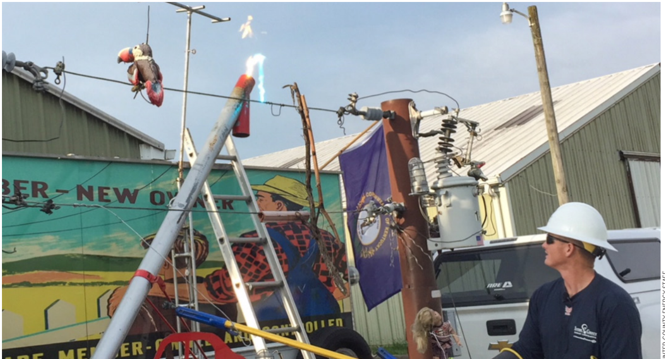
INTER-COUNTY ENERGY STAFF