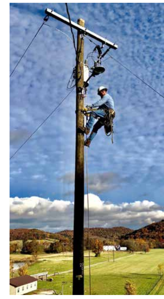
Chase Gander is one of many dedicated linemen helping to bring safe, reliable energy to our members.

Before our lineworkers begin any job assignment, we first assess the staffing and equipment needs. A mandatory job briefing discusses the objective, location of the worksite, potential hazards, nearest emergency help and if anyone besides Inter-