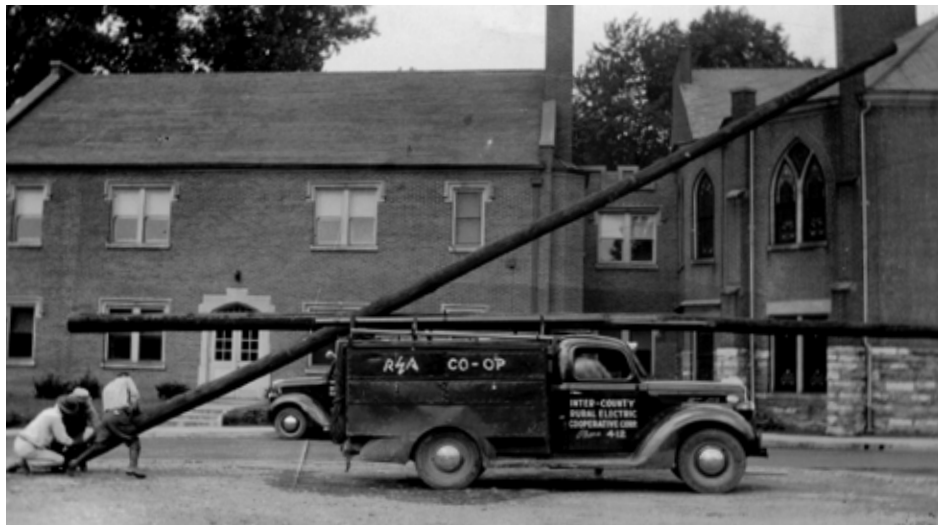
An Inter-County crew manually loading a pole.