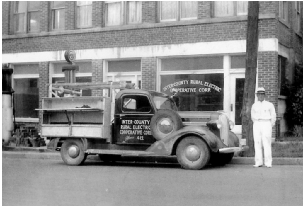
Inter-County's office on West Walnut Street in Danville from May 1938 to April 1940.